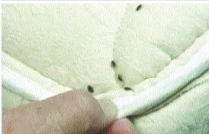
Signs of active infestations