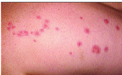
Bed bug bite

The problem we have today is that although there are now less-toxic pesticides available, they have proved to be far less effective in killing bedbugs. It is also quite difficult to get new pesticides approved by the federal government, particularly any pesticide that could come in direct contact with humans. Fortunately, there are options that are proving to be both effective and safer for the user and the environment. One is the use of professional steam cleaners.