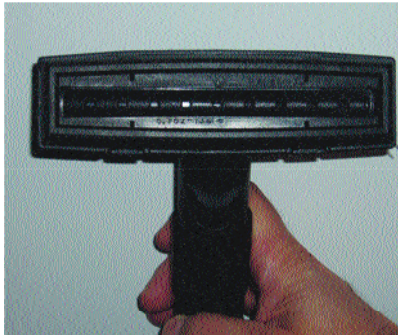
Tools with multiple steam ports provide even coverage.