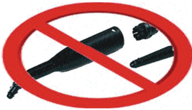
Single spray jets can fling bed bugs from the surface without killing them