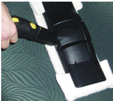
Direct contact and increased heat when used with a cloth wrap

treatment provides such an effective kill rate, the primary focus of the use of pesticide essentially changes from the primary means of attack, to that of providing residual kill benefit. Hence, use of a professional-grade, commercial steamer or other forms of heat treatment, is one of the most effective means of addressing a bed bug infestation in a “socially responsible” manner. It really does little good to rid a facility of bed bugs, if in doing so you create another set of problems with respect to toxicity of the area treated. That is why use of a commercial-grade steamer, followed by appropriate chemical treatment is a much more environmentally preferred means of addressing an infestation.