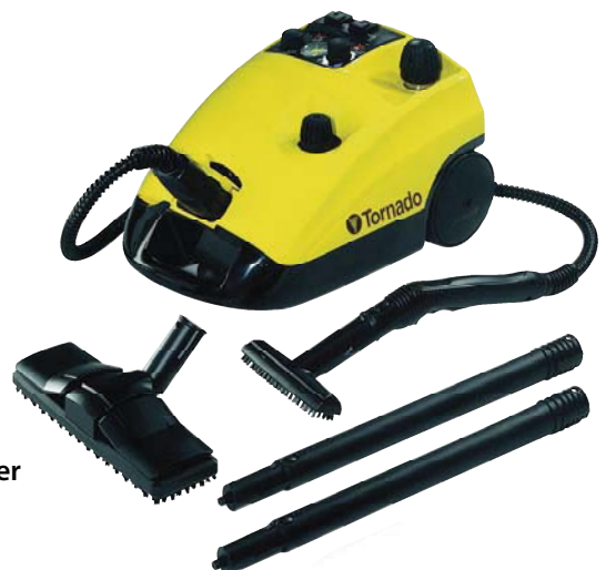
Tornado's DE 4002 Steam Cleaner

Use of a HEPA Vacuum and Tornado DE 4002 Steamer can dramatically lower the amount of pesticide needed.