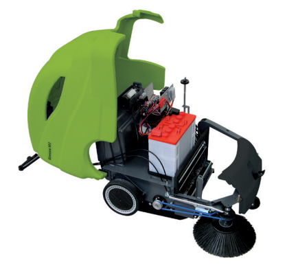
Easy access to internal components Simple to tilt entire top body