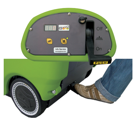
Maximum comfort and extreme ease of use