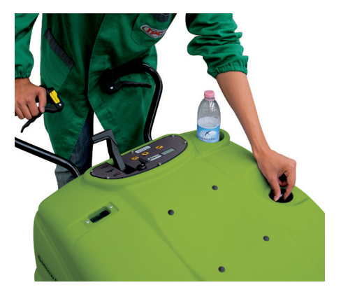
Maximum brush wear saving - Main brush pressure is easily adjusted from walking position