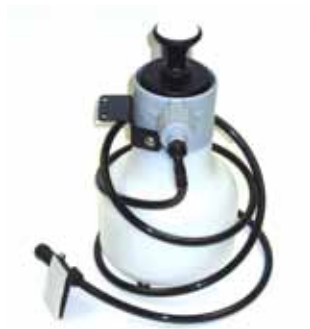
Optional Spray Kit

Cleans 7,500 sq. ft. per hour and 15,000 sq. ft. on one battery charge!