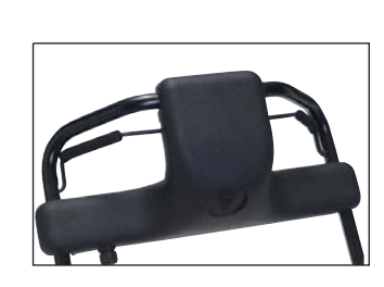
Operator-friendly An ergonomically-designed handle with cushioned grips and safety switch are standard.

Storage made simple The CK 3030's handle folds down and the unit can stand on end for storage.